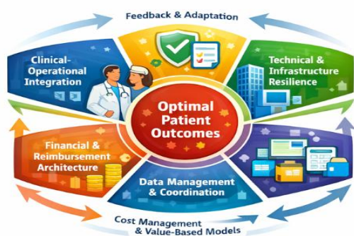
Figure 2. Five-Pillar Ecosystem Enabling Sustainable Delivery of High-Cost Advanced Therapies Building the Advanced Therapy Center of Excellence

The evidence compels a singular conclusion: delivering advanced therapies requires a deliberately constructed, system-wide program, not an ad-hoc addition to existing services. The most successful models are organized as Advanced Therapy Centers of Excellence, characterized by formal governance, dedicated resources, and an ingrained culture of