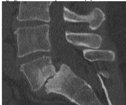
Fig. 2: Grade II Spondylolisthesis. Lumbar spine sagittal CT of L5-S1 revealing grade II spondylolisthesis.

indications. This approach maximizes diagnostic yield while minimizing unnecessary radiation exposure and facilitates timely escalation to advanced imaging when clinically indicated [6].