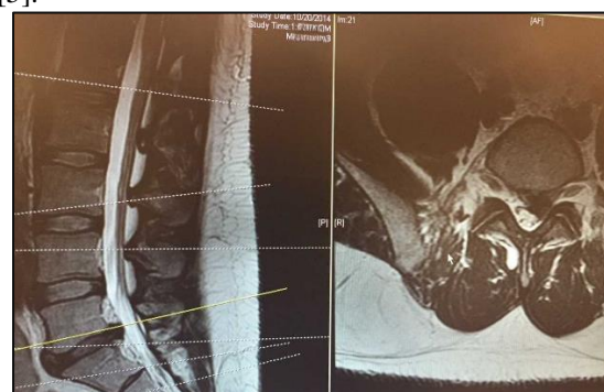
Fig. 1: Magnetic Resonance Imaging, Lumbar. The image shows T2-weighted sagittal and axial views of lumbar MRI.

central gelatinous nucleus pulposus and the surrounding fibrocartilaginous annulus fibrosus. Standardized terminology for disc pathology is guided by recommendations from the American Society for Spine Radiology, the American Society for Neuroradiology, and the North American Spine Society. The most recent update, Lumbar Disc Nomenclature version 2.0, published in 2014, refined definitions established in the original 2001 version [5]. Disc herniation occurs when disc material extends beyond the margins of the intervertebral disc space, often impinging on adjacent neural structures. Posterior disc herniations are a frequent source of nerve compression and symptomatic radiculopathy [5].