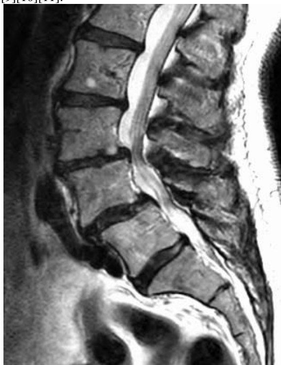
Fig. 3: Sagittal MRI of Lumbar Spine With Spondylolisthesis, L3-4 and L4-5.

sequences in axial and sagittal planes, including T1, T2, and STIR (short tau inversion recovery), allow detailed assessment of varied pathological processes (see Image. Lumbar Disc Degeneration, Multiple Levels; Sagittal MRI of Lumbar Spine With Spondylolisthesis, L3-4 and L4-5). Post-contrast T1 sequences enhance detection of spinal infections, postoperative changes, vascular malformations, primary tumors, and metastases. MRI is particularly effective in evaluating metastatic disease in the lumbar spine, including prostate cancer involvement, and identifying complications such as spinal cord compression. STIR sequences are highly sensitive to marrow edema, revealing areas of increased signal associated with trauma, infection, or malignancy [9][10][11].